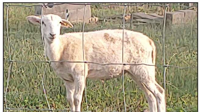
EATING LESS OR OFF FEED 1