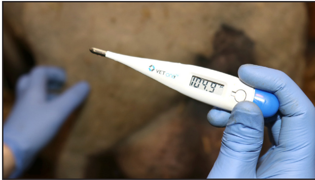
FEVER (>104°F, >40°C) 1