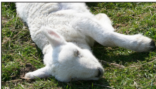
SUDDEN DEATH IN LAMBS 4