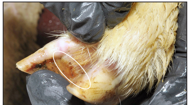
RED OR WHITE ABOVE THE HOOF 2